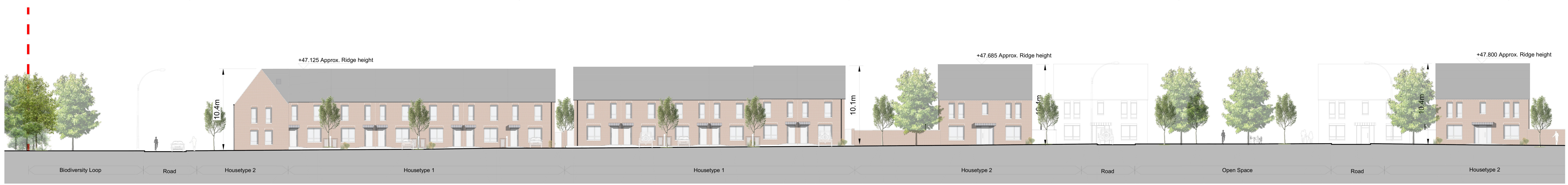
SECTION P 1/2

© This drawing is copyright 1. Do not scale this drawing 2. Times and dimensions to be immediately notified to the Architect 3. All dimensions to be checked on site