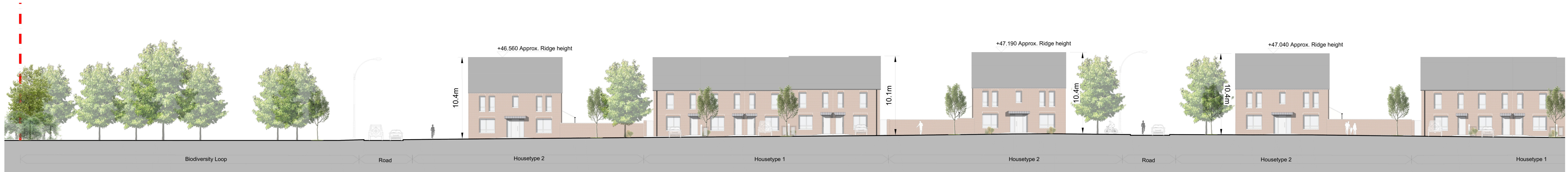
SECTION Q-Q 1/2