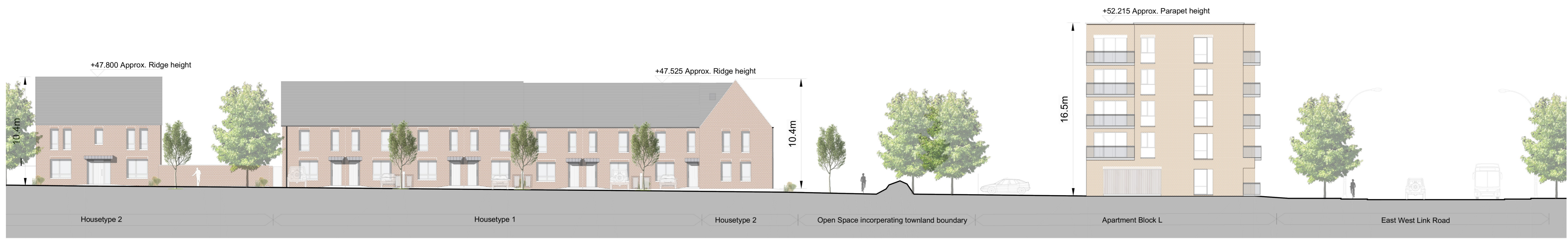
SECTION P Continued 2/2