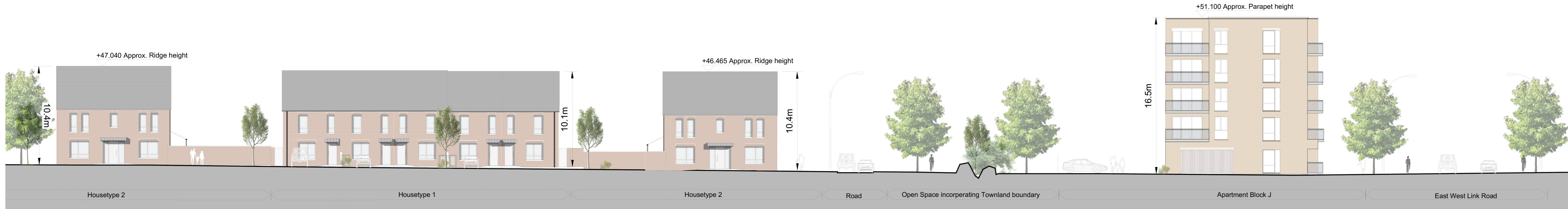
SECTION Q-Q Continued 2/2